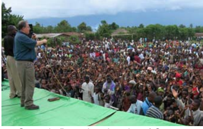
Crusade Deep Into Interior of Congo

S moking Volcano: The backdrop of the crusade deep into the interior of the Democratic Republic of Congo was an active smoking volcano. Haunted by years of war, violence and disaster, several thousand people responded to the salvation invitation. Over 4 million people have been killed in this volatile region in the past few years and for many the only remaining hope is heaven. While extremely difficult, this is one of the earth's ripest harvest fields.