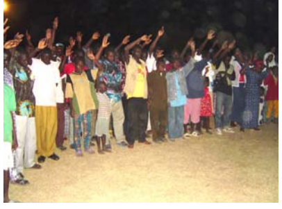
Nightly Response to Salvation Invitation

Muslems Respond To Gospel: With daytime temperatures exceeding 110°F and hot, sand filled Sahel winds, the night meetings provided some relief to the heat. Over 1,000 people responded to the salvation invitations during the campaign. Each day I was able to preach the gospel through a radio broadcast in this Islamic country. According to local sources the broadcasts were widley heard and extremly effective. At the conclusion of the crusade a new church was started with trained leaders.